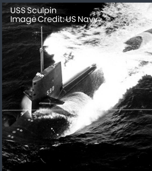
USS Sculpin

In this month's issue, we compare the Virginia Class of submarines to the Shipjack-class, which was in service from 1959-1990