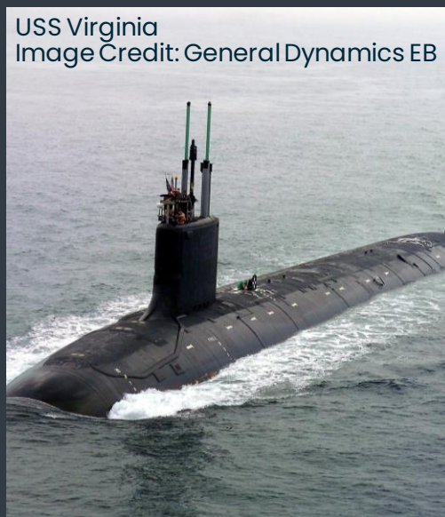
USS Virginia

6 (last retired in 2004) First to combine control room and attack center 6 angled torpedo tubes 251 ft 3569 tons 78 MW Westinghouse S5W 93 Fairwater & Stern planes First to integrate radar system into periscope BQS-4 Sonar suite USS Sculpin (SSN 590) USS Scorpion memorial in Little Rock, Arkansas